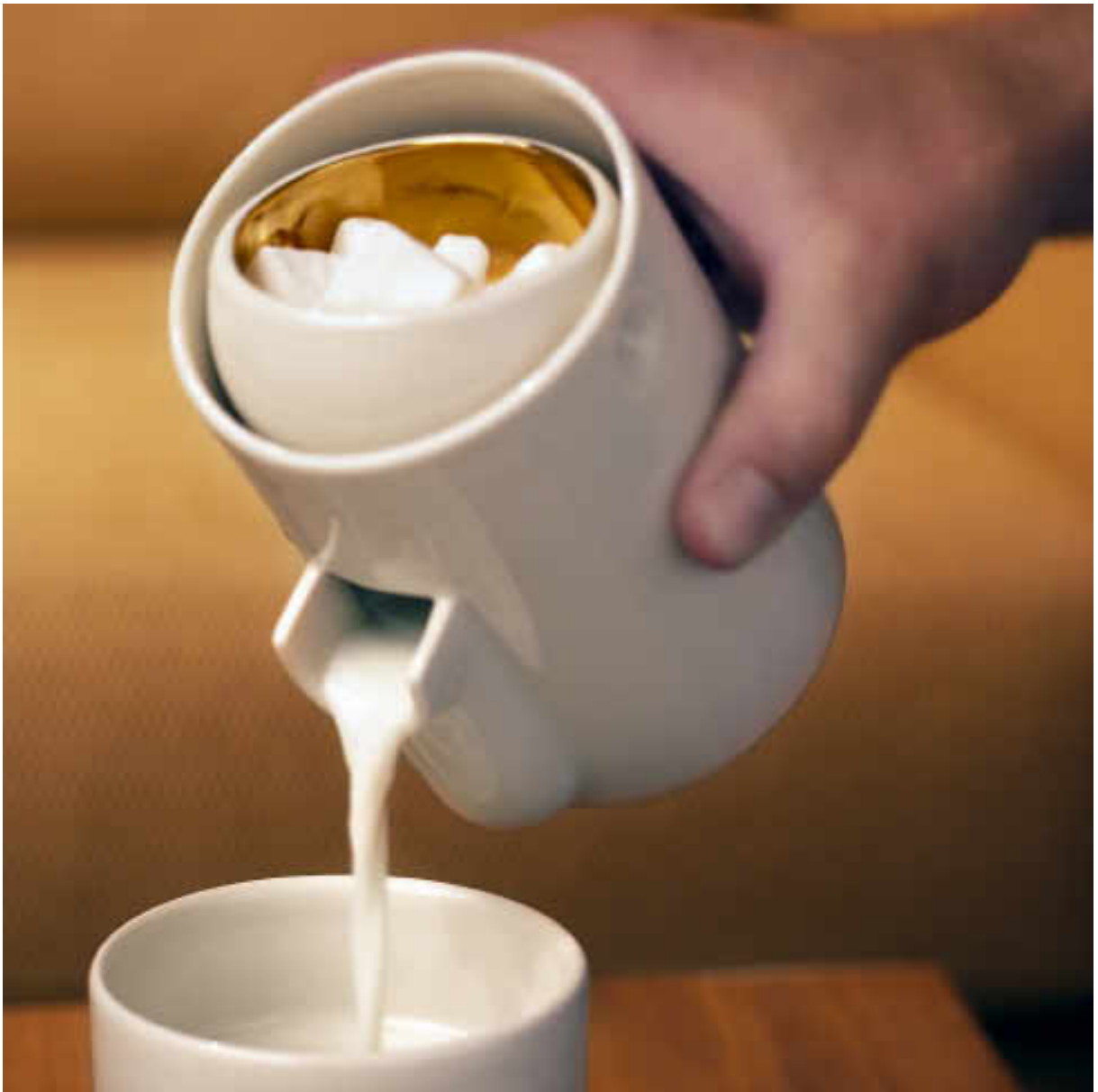
Designed for Tonfisk by Tanja Sipilä